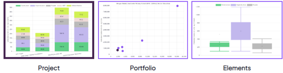
Morgan Sindall Construction, Gorton Community Hub (GIFA: 6,733m2, Sector: Offices)